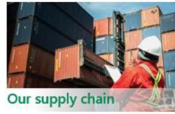
Our supply chain